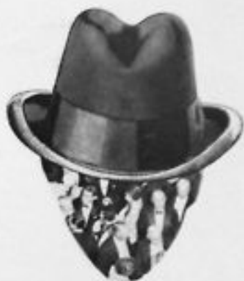
THE BLACK HOMBURG—correct for wear with the dinner jacket at the semi-formal events, indoor sports at night and town wear.