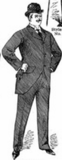
Style No. 12.