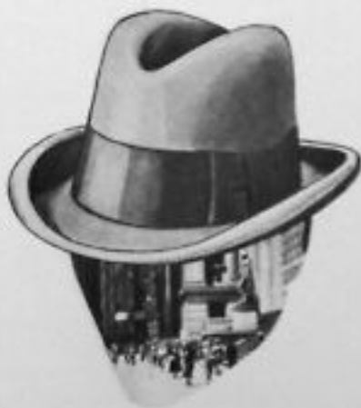
THE SILK BOWLER HOMBURG—is a very dressy hat; it substitutes for the derby as a semi-formal hat for town wear.