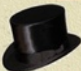
Black Non-Collapsible Top Hat