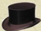
Black Collapsible Top Hat