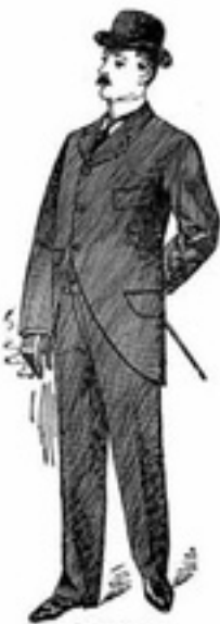
Style No. 11.