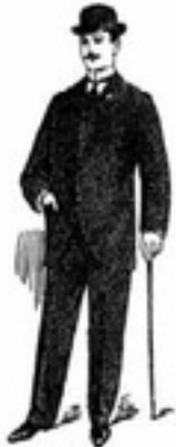
Style No. 9.