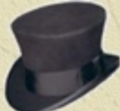
Belled Top Hat