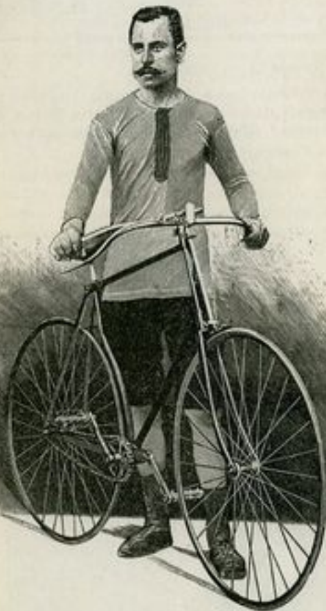
M. TERRONT, CHAMPION BICYCLE RIDER OF THE NATIONAL ASSOCIATION OF FRANCE.