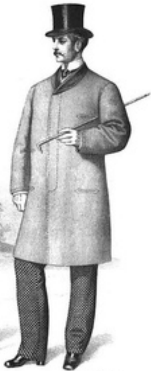
de l'Institut de France