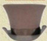
Mad Hatter Top Hat