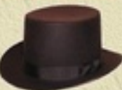
Child's Top Hat