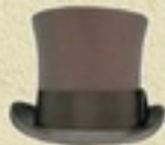
High Top Hat