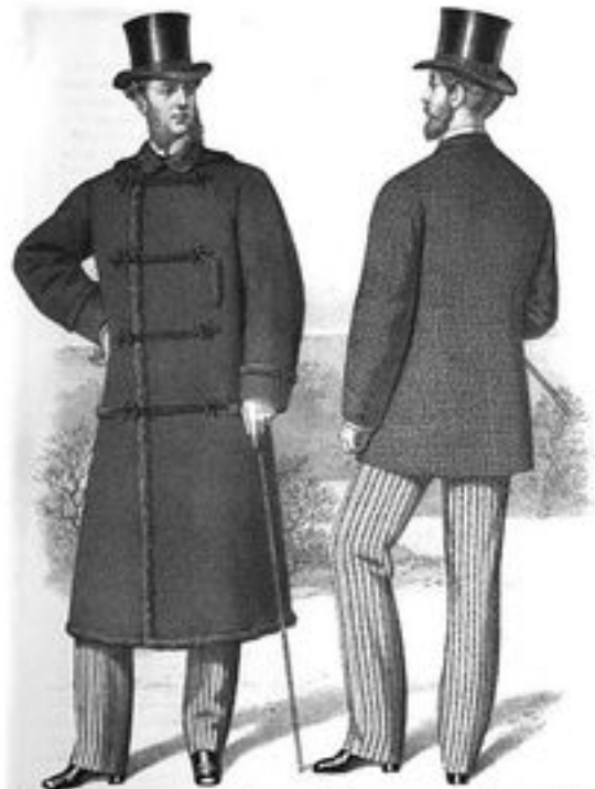
Exhibit A 1774