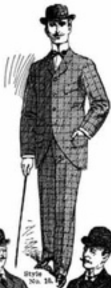
Style No. 10.