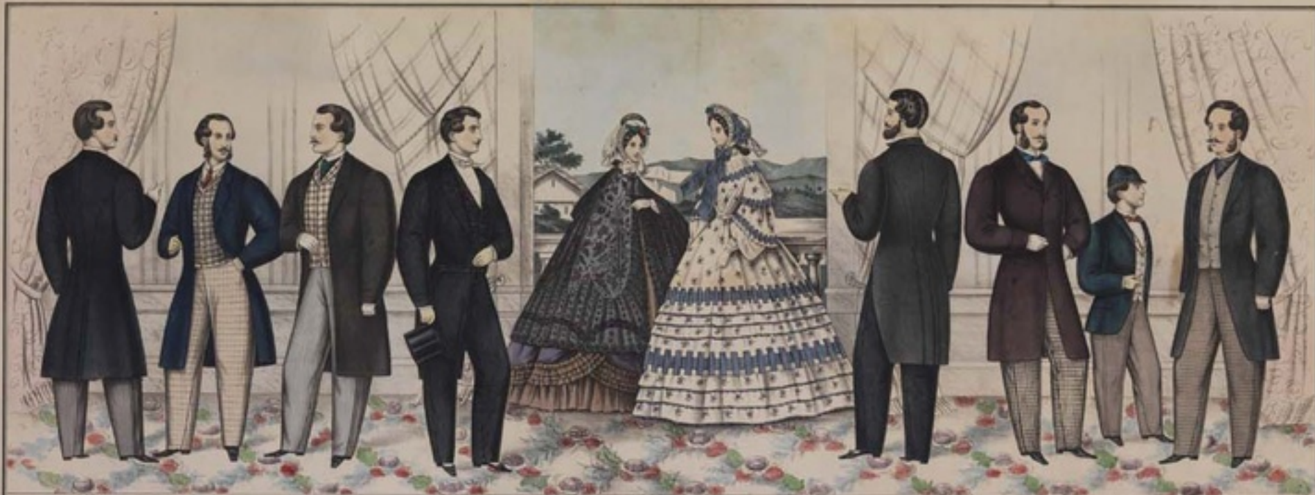
PHILADELPHIA, PARIS & NEW-YORK FASHIONS FOR SPRING & SUMMER OF 1866. PUBLISHED & SOLD BY T. MAHAR, NO. 814 CHESTNUT STREET, PHILADELPHIA.