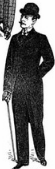
Style No. 13.