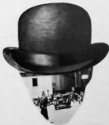
THE DERBY—the semi-formal day wear for general in-town use; well dressed men never accept it for correct evening wear.