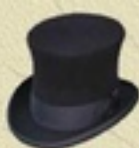
Squire Top Hat