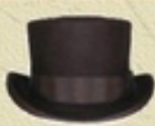
Low Top Hat