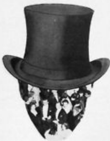
THE FOLDING OPERA HAT of dull merino cloth—correct for either formal or informal evening affairs that are purely social ones.