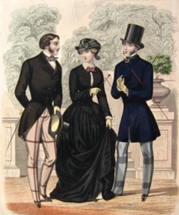
Illustration from GENTLEMAN'S MAGAZINE.