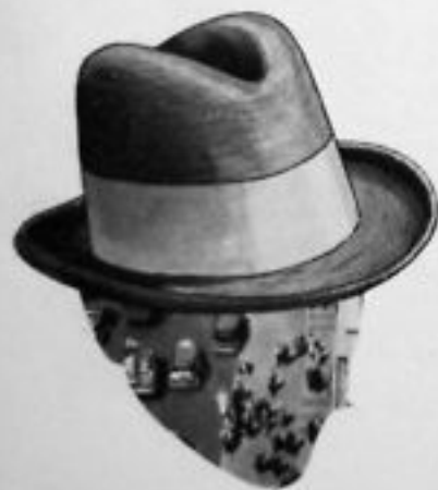
THE ROCCO FELT HOMBURG HAT—is correct for town wear with rough suitings or with a spectator sports kit not "country".