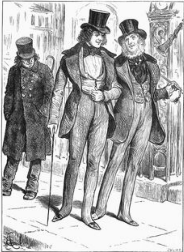
"Whenever Jonathan Charley ran over on the shady side of Prowdity or Tall-walk, he had a Lord-stay-to-arms with him; and there was a battle round the corner."