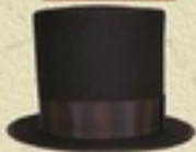
Abe Lincoln Top Hat