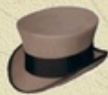
John Bull Top Hat