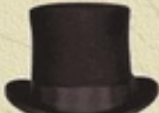
1860 Top Hat