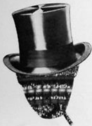
THE SILK TOP HAT—for formal day wear with morning coats and for the very formal evening affairs when the tailcoat is worn.